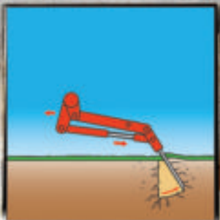
Verti-Drains adjustable parallelogram design shatters the soil, and also allows for clean Coring, on all models.